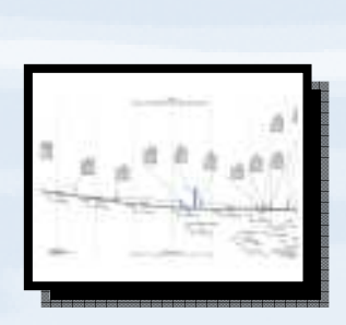
PCI Professional Consulting, Inc.

For evaluation, the Ossining Sewer District was divided into two major sections. The northern section includes the Scarborough Road trunk sewer and all connecting branches and upstream tributaries, encompassing two (2) pumping stations and 33,300 linear feet of gravity sewer mains. A sanitary sewer evaluation study (SSES) was previously prepared by PCI in October 2008 for the northern section of the District.